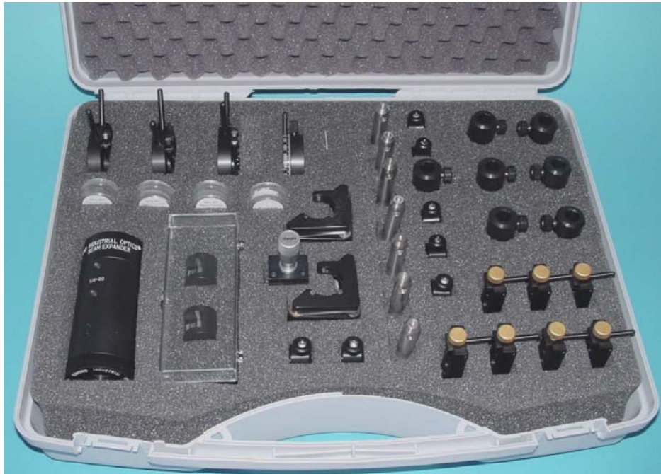
Fig. 1: Education kit of the VCT AG for internal and external conical refraction

The VCT AG offers an education kit to demonstrate both internal and external conical refraction with modern laser technology. The setup consists of optical components like lenses, \lambda/4 -plate, beam expander, mounted MDT crystals and required mechanical components. The components can be adapted to any existing laser source. It means that for each wavelength and diameter of the incoming laser beam a suitable setup can be assembled.